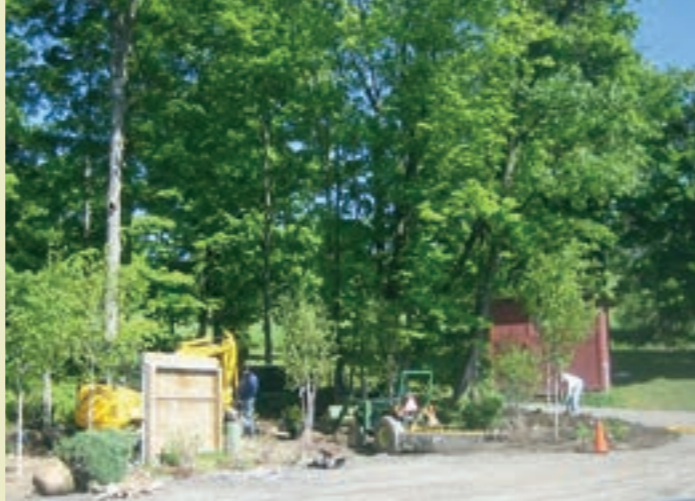
Planting at Olana.