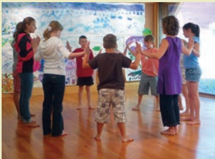
The Journey at the Wagon House Education Center.