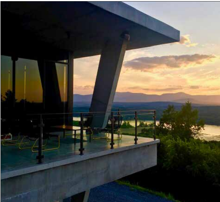
Architecture by KOKO Architecture & Design

Completed in 2018, this home – an integrated environment of art, architecture and landscape – also features a Nick Cave Soundsuit (top right), as well as works by other contemporary artists. Ascend a walkway, cross a 60' bridge over a designed landscape of native stone and specimen plantings, experience heightened Hudson River and Catskill Mountain views, and inhabit a fantastical world at sunset. Much like Frederic Church's Olana, this home has been created by its owners in response to 360-degree views and a spectacular naturalistic hilltop setting.