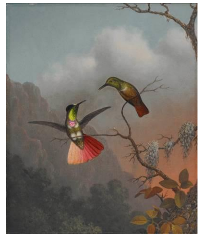
Martin Johnson Heade, Hooded Visorbearer , ca. 1863–64, oil on canvas, 12 1/4 x 10 in. / Framed: 18 1/4 x 16 1/2 in. Crystal Bridges Museum of American Art, Bentonville, Arkansas; 2006.93.

Catskill and Hudson, NY – March 1, 2021 – The Olana Partnership, Olana State Historic Site, and the Thomas Cole National Historic Site announced today that “Cross Pollination: Heade, Cole, Church, and Our Contemporary Moment” will open on June 12 at the two historic sites – the only opportunity to see the unique presentation of the exhibition in New York, in the landscapes and historic spaces that so dramatically influenced and continue to influence the evolution of art in America. For the first time in over two decades, 16 paintings from the influential series of hummingbirds and habitats – The Gems of Brazil (1863-64) – by Martin Johnson Heade (1819-1904) will be on view in New York for public audiences. The project uses the metaphor of cross-pollination inspired by Heade’s paintings to explore interconnections in art and science, between artists, and across the 19 th and 21 st centuries. Paintings, sketches, sculpture, and natural history specimens will be displayed in provocative juxtapositions.