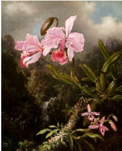
Martin Johnson Heade, "Tropical Orchid," c. 1871-74, Oil on canvas, 21¼ x 17½ in. / Framed: 25¼ x 21¾ inches. Olana State Historic Site, NYS Office of Parks, Recreation, and Historic Preservation, OL.1981.39

though, with his series The Gems of Brazil , was making a different kind of "landscape" that magnified the intricate operations within nature itself. Heade traveled to Brazil in 1863, so that he could study the hummingbirds in their natural habitat. Heade's focus in The Gems and his related writing, which decries the overhunting of bird species, aligns with the proto-environmentalism of Thomas Cole, who wrote against deforestation in his own time. Heade's own Brazilian journey was inspired by Frederic Church's travels in Latin America. The environmental awareness and advocacy of these 19 th -century artists connect thought and conversations taking place today, as concern for preservation and protection of the environment reaches critical urgency.