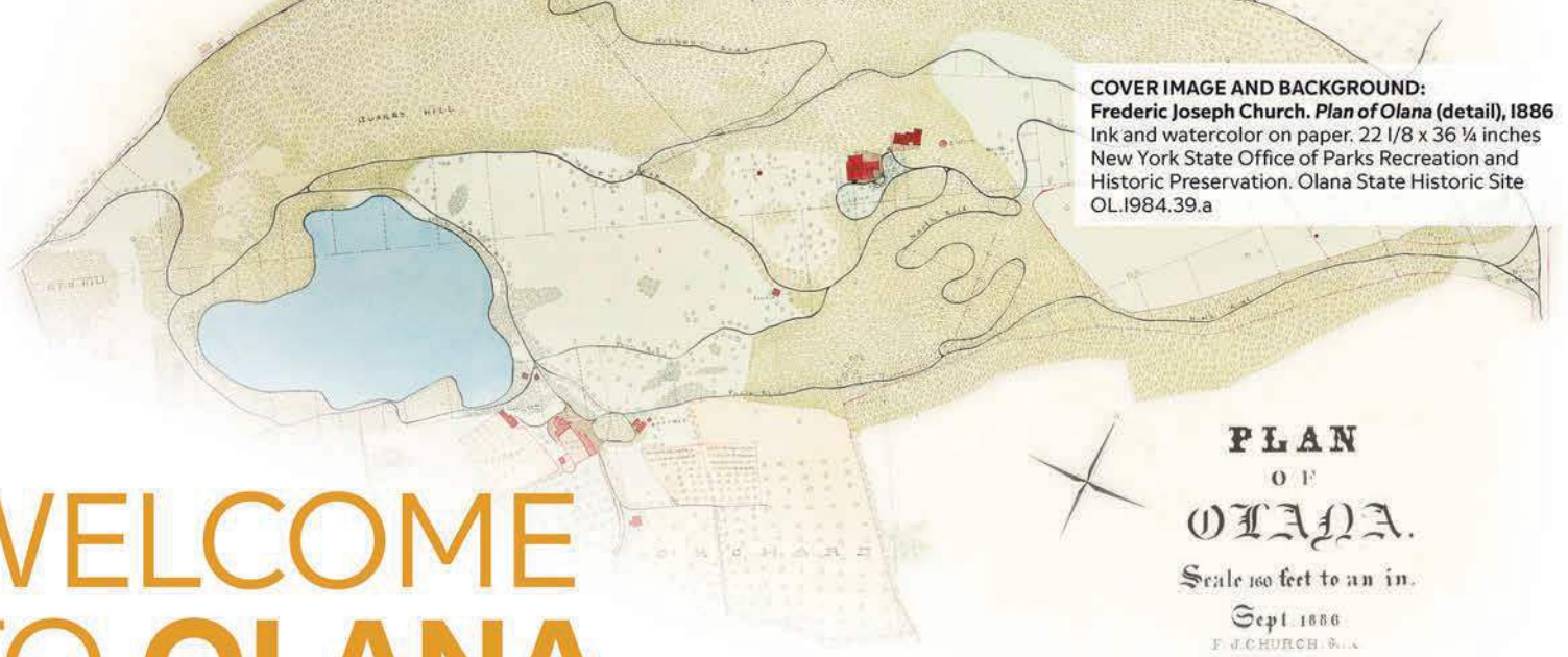
COVER IMAGE AND BACKGROUND: Frederic Joseph Church. Plan of Olana (detail) , 1886. Ink and watercolor on paper. 22 1/8 x 36 1/4 inches. New York State Office of Parks Recreation and Historic Preservation. Olana State Historic Site OL.1984.39.a